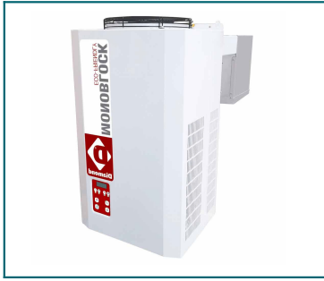
INDICATIVE PRODUCT IMAGE