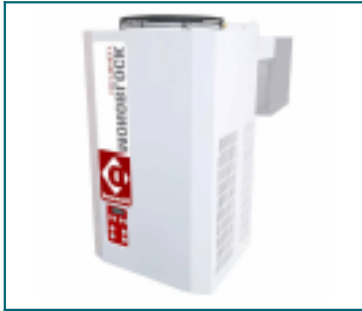
INDICATIVE PRODUCT IMAGE