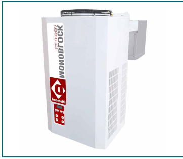
INDICATIVE PRODUCT IMAGE